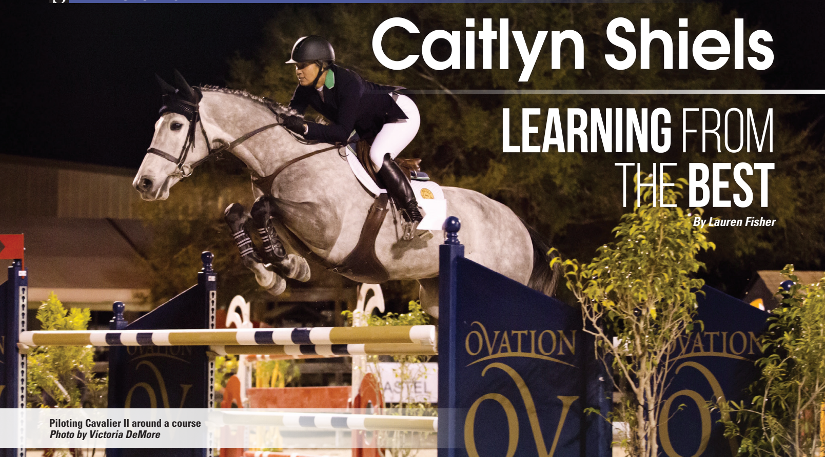
Piloting Cavalier II around a course